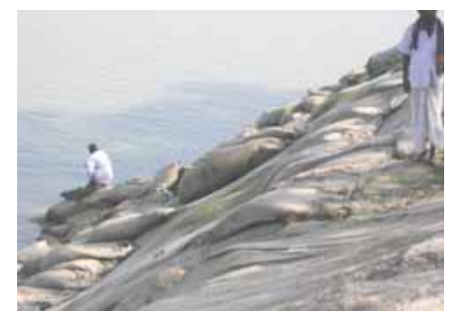
Fig.3 Geobags for bank protection

the peak river flow. This clearly indicates the alertness and awareness of government but necessary steps in this direction especially for long tern protection of earthen embankment from failure should be taken into account urgently.