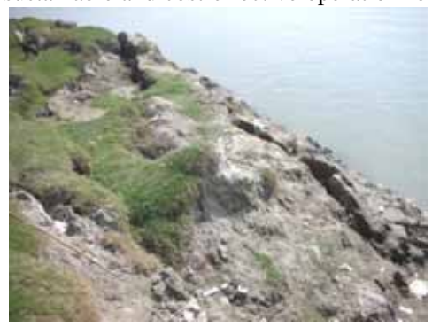
Fig.2 Embankments failure

information on embankment failure such as geometry, soil conditions, river position, flood water levels, construction procedure, materials used, hydraulic and hydrologic condition are collected from different sources for instance, local people of the areas of embankment failure, officials of BWDB, contractor connected to the design and construction of the embankments. To understand the physical properties of the embankment materials, samples from the failed location are collected and analyzed. The cross-sections of the embankments are drawn in order to investigate the geometry of the failed embankments, stability of slopes and other parameters. The analyses of stability of the failed embankments are performed by the determinate method because of its ease in calculation, accuracy and handiness in application to the field with and without water storage conditions.